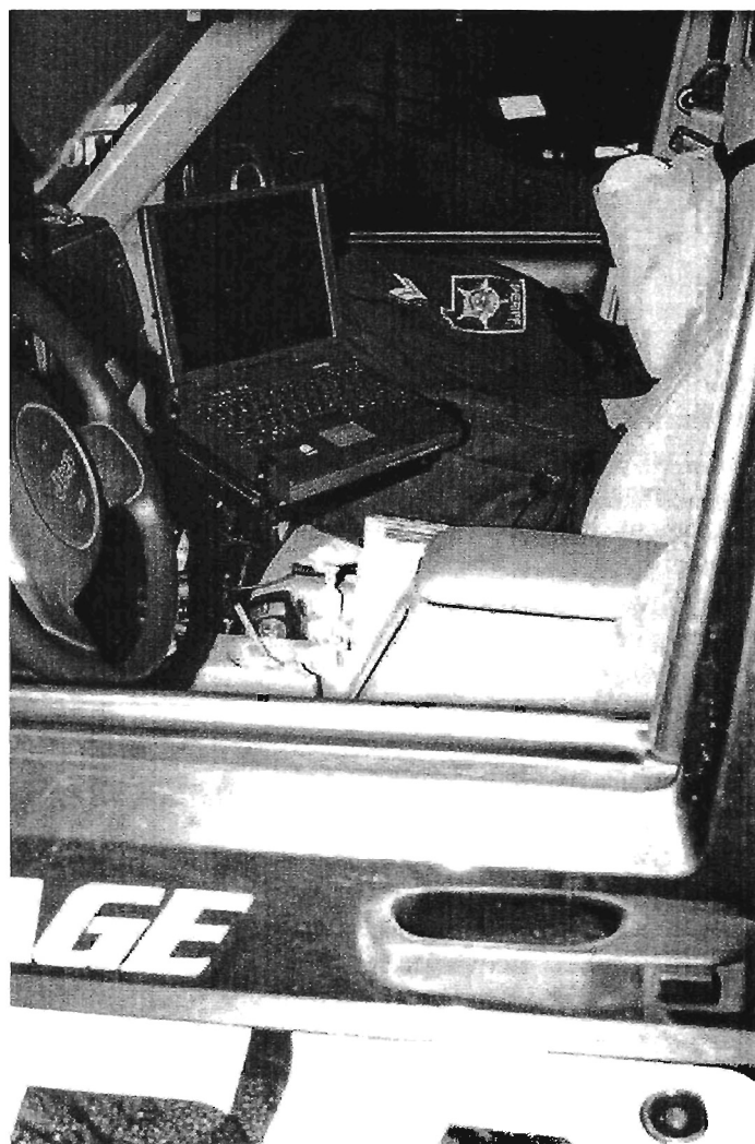
Top and Bottom- Most MDTs will look like these

We invite our readers to stop at our web site and visit our new Scanning USA forum chat board! Post your scanner related questions, see what is cooking, or post your answer to someone else's question!