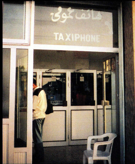
Tunis, Tunisia. Taking photographs in public here is considered an offense worthy of incarceration. This was a "drive-by" of one of the payphone rooms that exist throughout the city - there are no single payphones anywhere.