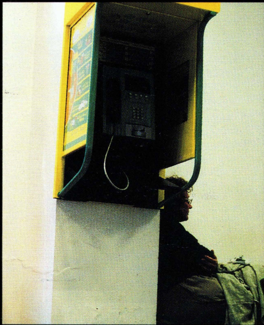
Alexandria, Egypt. It's illegal to take pictures in Egyptian airports. Here's one they couldn't stop.