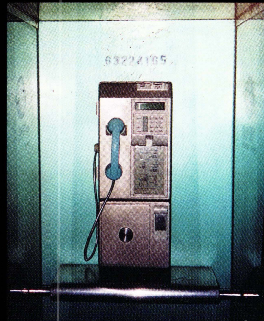
Shanghai. This type accepts both coins and cards.