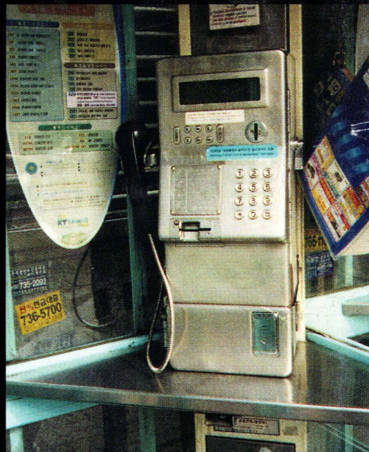
Seoul. A coins-only version, also fairly common and usually found near the cards-only phones.