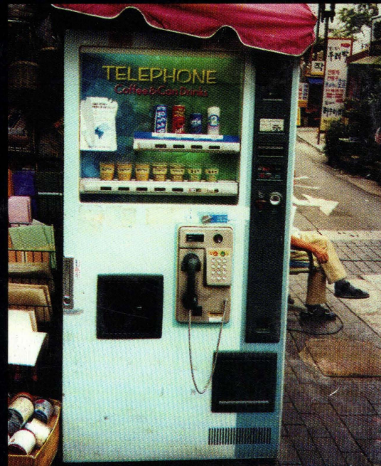
Seoul. This is a rare phone too. Its location is probably even more rare.