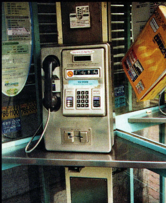
Seoul. The most common type of payphone which only accepts cards.

(we will pay any price for pictures of North Korean payphones)