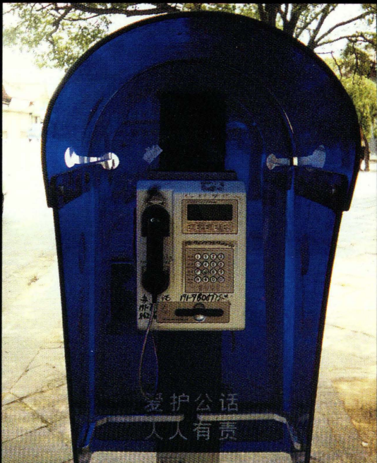
Xi'an. This card-only phone is the most common type. The writing on the blue plastic says: "It is everyone's duty to be careful with public phones."