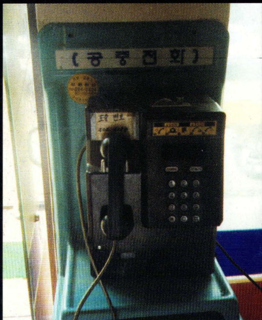
Kyeonghee University. The old style coins-only payphone which is becoming increasingly rare.