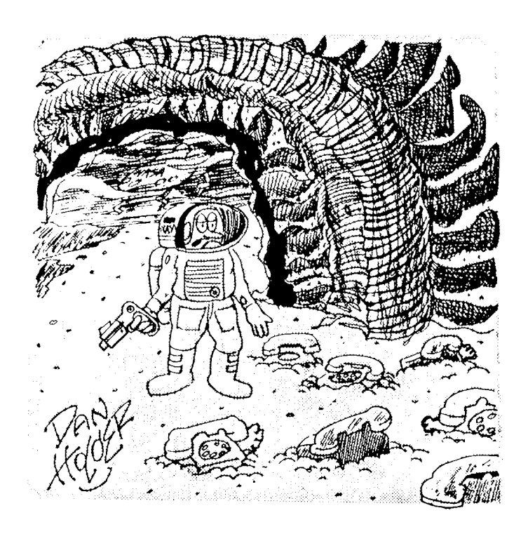
"Yep, there's no sign of intelligent life here!"