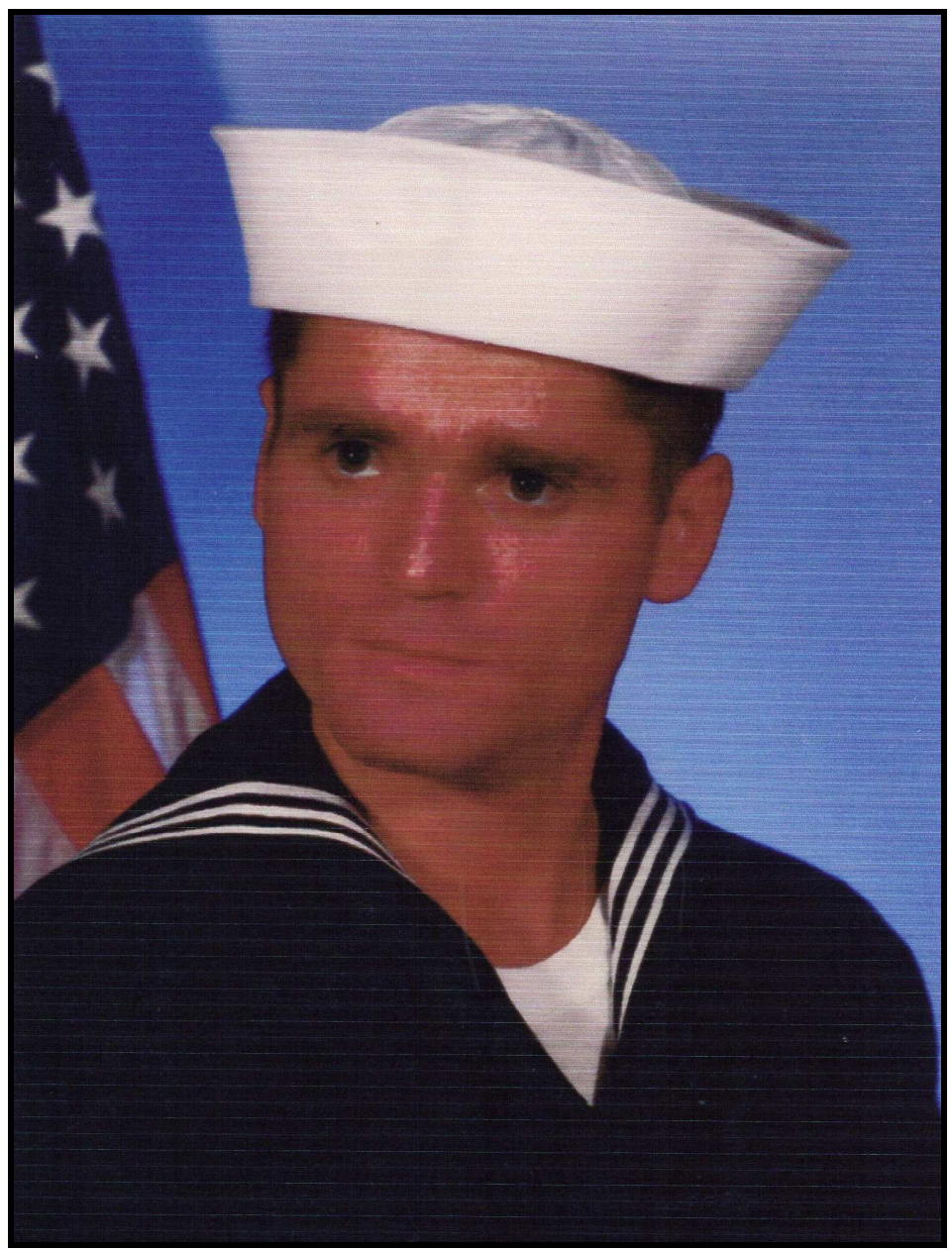
Recruit Training Command, San Diego, California, September 1986.