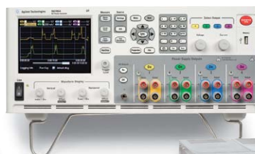
Agilent N6705A DC power analyzer