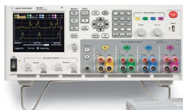
Agilent N6705A DC power analyzer