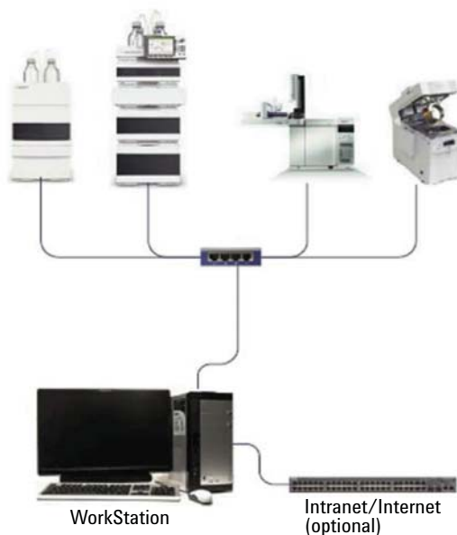
Figure 1 Workstation configuration

Depending on the type of installation, you may need different hardware components. The following graphics show the required components for each scenario.