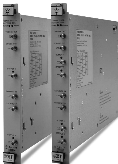
Agilent E8311A and E8312A