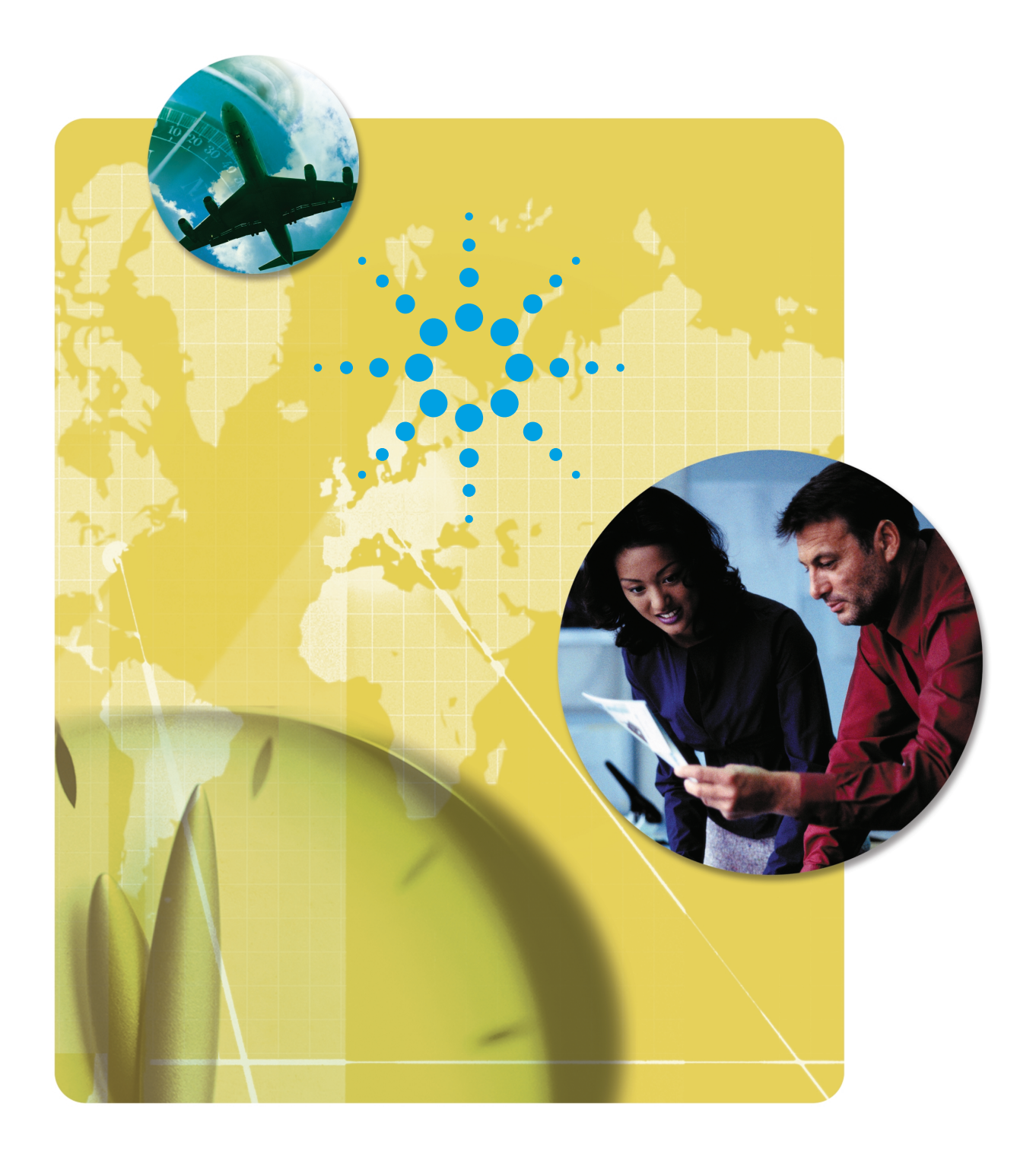
Electro Rent An Agilent Premier Rental Partner

Get the Latest Test and Measurement Equipment Fast!