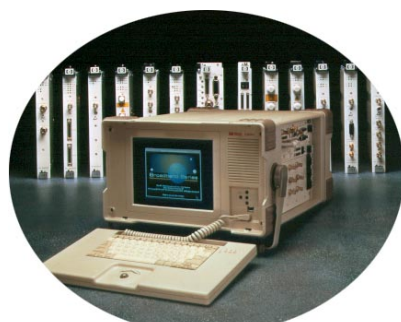
E4200B Form-7 Base Platform