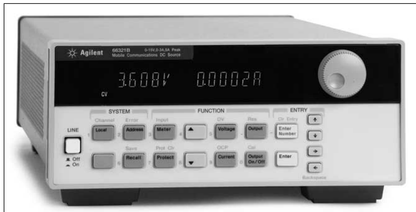
Fig. 1. Solution-focused programmable supplies, such as the 66321D dc source from Agilent Technologies, meet the increasingly specialized testing needs of many production test laboratory applications.

A more practical solution for today's complex test requirements lies in the solution-focused power source. While application-specific fixed-output power supplies have always been manufactured for various industries, today's high-volume manufacturers are accelerating this trend toward solution-focused system power products.