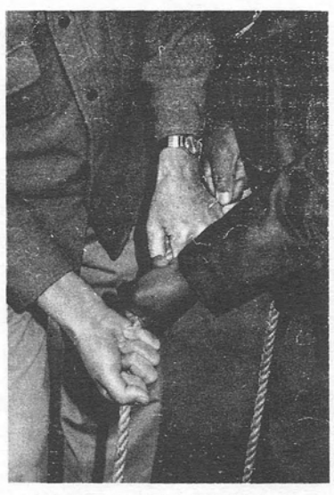
(A) INITIAL GRIP POSITION ON RESCUE ROPE