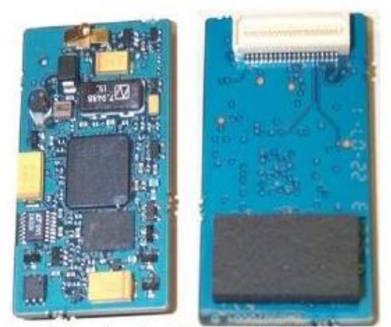
Astro Spectra Plus NTN9801 UCM

Astro Saber / Astro Spectra UCM (Typical)