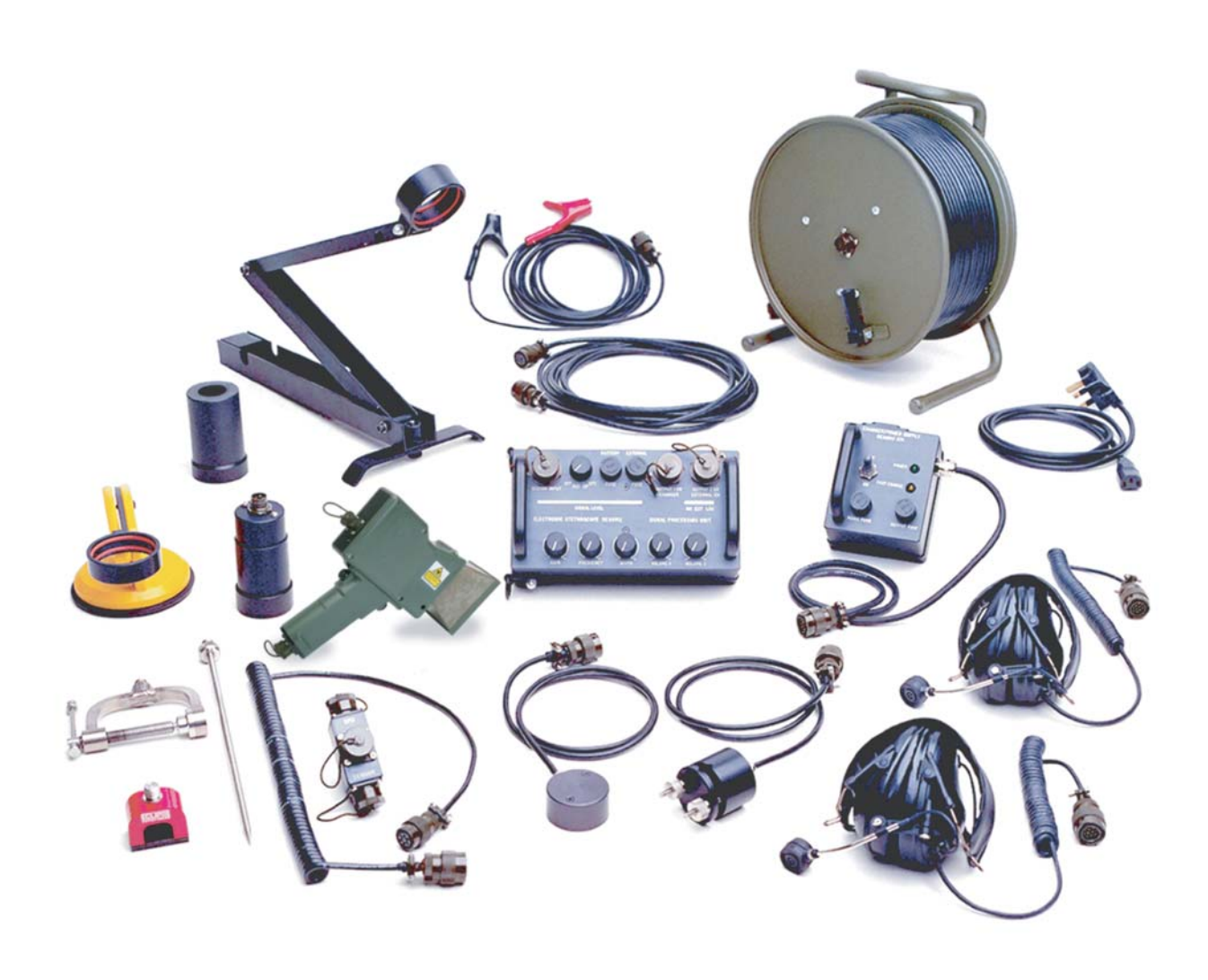
Complete equipment excluding Transit Case and Shoulder Strap for SPU