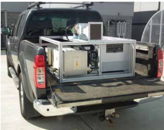
Typical vehicle insertion

e2v have developed demonstration hardware with proven effects for engine stopping and disruption by utilising our patented switching products in conjunction with high power magnetrons, and carefully packaging these with appropriate antennas. This design approach has resulted in a flexible solution which can be rapidly adapted to suit specific customer needs and achieve optimum performance.