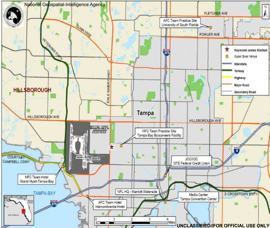
(U//FOUO) Figure 1: Super Bowl XLIII Venues