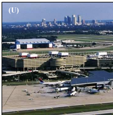
(U) Tampa International Airport

(U) The principal commercial airport serving the Tampa/St. Petersburg/Clearwater metropolitan area is the Tampa International Airport (TPA), is centrally located approximately five miles west of downtown Tampa. On an average day, TPA is home to more than 100,000 visitors. 5