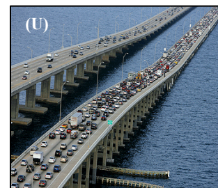
(U) Howard Frankland Bridge