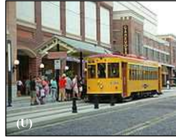
(U) TECO streetcar in Ybor City

(U) The free uptown-downtown trolleys and the TECO Line streetcars make it easy for shoppers, tourists, and convention goers to get around downtown Tampa and see the city sights. The in-town trolley travels through the business district while the TECO streetcar system links Ybor City, a historic Spanish District, the Channelside District entertainment complex, and downtown Tampa.