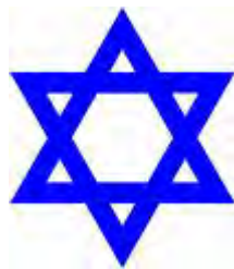
Star of David

This symbol, like everything else the Jews claim as their own, was stolen from the Hindu 'Star of Vishnu.'