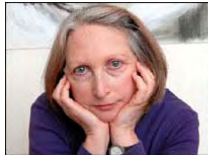
The Jewish 'Sleepy-eye'