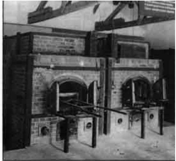
Two crematoria ovens: the number of Jewish corpses allegedly disposed of without trace, via such ovens, is improbably high