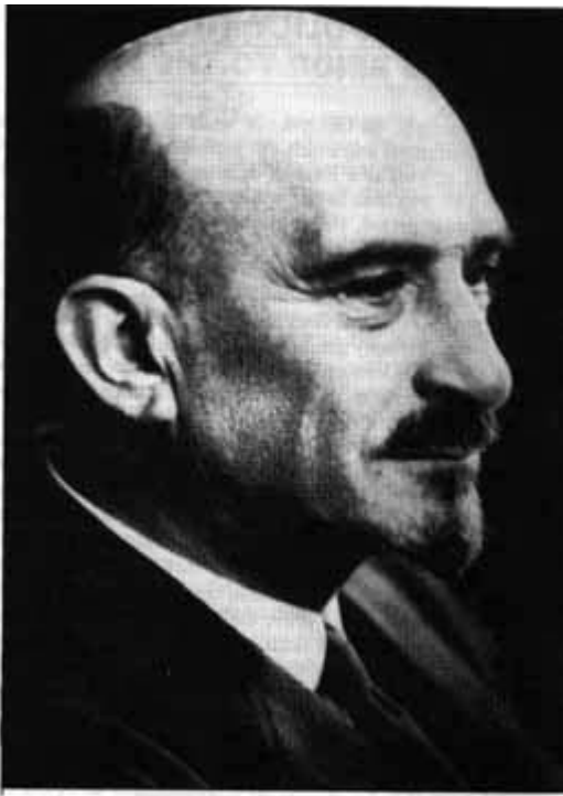
Chaim Weizmann. He declared war on Germany