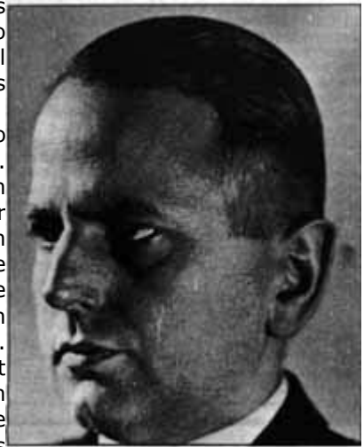
Otto Ohlendorf: he denounced concentration camp fraud