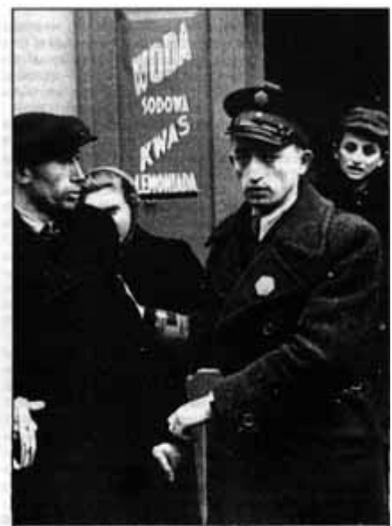
Jewish police in action in the Warsaw Ghetto

As we have seen, transportation to camps is alleged to have ended in "extermination" but there is absolutely no doubt from the evidence available that it involved only the effective procurement of labour and the prevention of unrest. In the first place, Himmler discovered on a surprise visit to Warsaw in January 1943 that 24,000 Jews registered as armaments workers were in fact working illegally as tailors and furriers (Manvell & Frankl, ibid , p. 140); the Ghetto was also being used as a base for subversive forays into the main area of Warsaw.