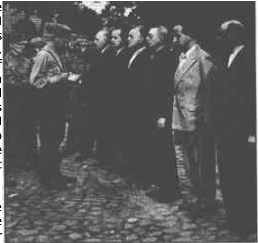
Communist political prisoners at Sachsenhausen in 1933

Rightly or wrongly, the Germany of Adolf Hitler considered the Jews to be a disloyal and avaricious element within the national community, as well as a force of decadence in Germany's cultural life. This was held to be particularly unhealthy since, during the Weimar period, the Jews had risen to a position of remarkable strength and influence in the nation, particularly in law, finance and the mass media, even though they constituted only one percent of the population. The fact that Karl Marx was a Jew and that Jews such as Rosa Luxembourg and Karl Liebknecht were disproportionately prominent in the leadership of communist movements in Germany also tended to convince the Nazis of the powerful internationalist and Communist tendencies of the Jewish people.