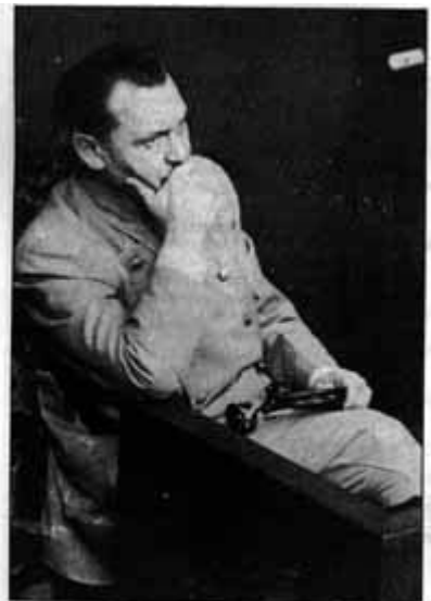
Hermann Goering at Nuremberg. He dismissed the Six Million accusation as propaganda fiction.