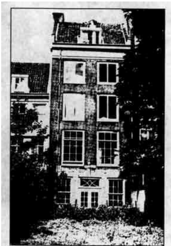
The Frank household in Amsterdam – it now attracts over half a million (paying) tourists every year.