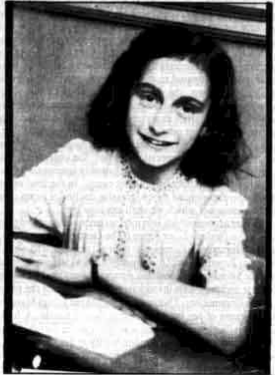
Anne Frank – a writer of precocious talent. In a 'diary' entry of 29 March 1944 Anne Frank described her book as " een roman ," a novel, but this is incorrectly translated in the published Diary and even in the Critical Edition as "a romance."

The Diary of Anne Frank purports to be the diary of a young Jewish girl kept while her family and four other Jews were hiding in a factory during the German occupation of Holland. Eventually the eight were arrested and detained in various concentration camps. Anne Frank died in Bergen-Belsen of typhus, by which time she was fifteen. When Auschwitz was liberated by the Russians Otto Frank was