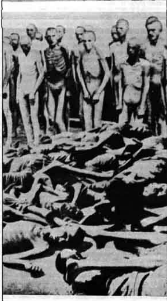
Fake atrocity photograph: the bodies in the foreground have been added