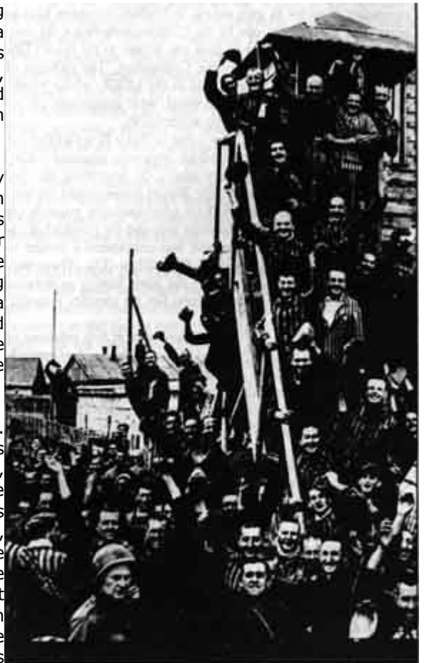
Healthy and cheerful inmates released from Dachau.

This fact was conclusively proved by the German archbishop. Cardinal Faulhaber of Munich. He informed the Americans that during the Allied air raids on Munich in September 1944, 30,000 people were killed. The archbishop requested the authorities at the time to cremate the bodies of the victims in the crematorium at Dachau. But he was told that, unfortunately, this plan could not be carried out; the crematorium, having only one furnace, was not able to cope with the bodies of the air raid victims. Clearly, therefore, it could not have coped with the 238,000 Jewish bodies which were allegedly cremated there. In order to do so, the crematorium would have to be kept going for 326 years without stopping and 530 tons of ashes would have been recovered.