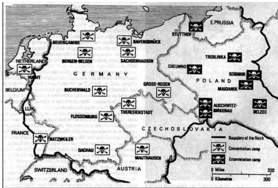
By a curious coincidence, alleged 'death camps' were all in territory subsequently controlled by the Communists

The exterminations at Auschwitz are alleged to have occurred between March 1942 and October 1944; the figure of half of six million, therefore, would mean the extermination and disposal of about 94,000 people per month for thirty-two months - approximately 3,350 people every day, day and night, for over two and a half years. This kind of thing is so ludicrous that it scarcely needs refuting. And yet Reitlinger claims quite seriously that Auschwitz could dispose of no less than 6,000 people a day.