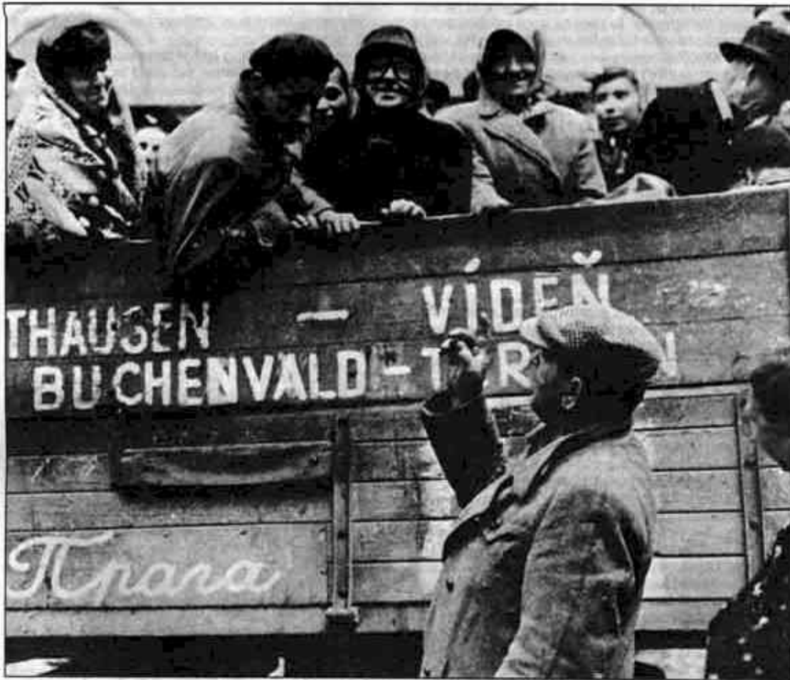
Concentration camp inmates on their way home in 1945