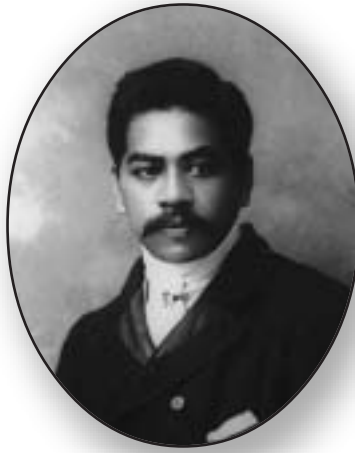
Prince Jonah Kūhiō Kalanianaʻole