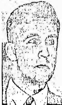
FRANCIS P. YOCKEY Final defiance

Francis Yockey's last note, written before he swallowed cyanide