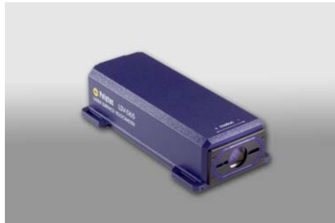
LSV-065 Sensor Head