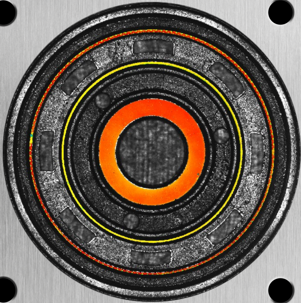
Figure 3: Topography of the lateral face and of two inner faces.