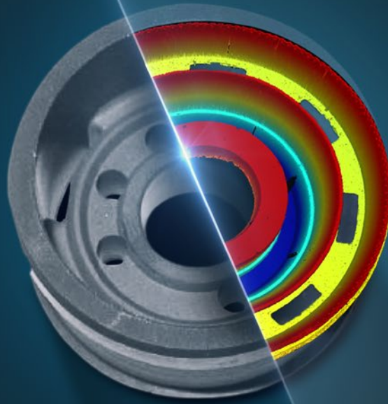
Figure 2: 3D optical surface metrology measures and visualizes step height, parallelism and further form parameters in a single measurement