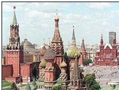
Moscow skyline

Q: Is there a difference between the Russians who betray their country and