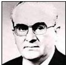
Yuri Andropov