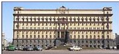
KGB Headquarters in Moscow

A: Not only the Navy. The FBI also. There are FBI people sitting across the street from our embassy in Washington taking photographs of everyone - yet they see nothing. Okay? Seriously now, how was this possible? First of all, it took place because all of our work on our side was properly done. I should say at the highest level. The work of our center in Moscow and Walker's handlers - everyone made certain that he was protected. The FBI has put our instructions to Walker on display. Each direction to a dead drop [document exchange] was precisely written and given to him in three different ways to insure that he understood them.