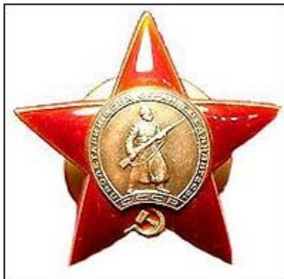
Order of the Red Star

Being brought up in such conditions, in the middle of 1942, on the second day after I graduated from middle school, I immediately volunteered to fight against the Germans. I was only 17-1/2 years old. According to the rules which existed at the time, I would not have been called up for at least six more months. But the fate of my country was at stake and I decided that I couldn't wait. My mother, a loyal Russian woman, blessed me. I was ready to die for my country. I have always been ready to die for my country.