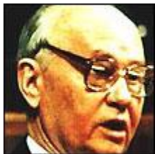
Vladimir Kryuchkov