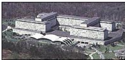
Aerial view of CIA headquarters, Langley, Virginia

A: It is not something which I know. But I would like to say a few words about the atmosphere which was created after the arrest of Ames. You will remember that all of America was furious at Russia. You will remember the angry statement that President Clinton made about our spying. You will remember that he ordered several of our people out of your country and that he even sent a special CIA team to Moscow where it demanded to look into our very files. You will remember the angry speeches in Congress and the threats about cutting U.S. aid. So I would like to ask you: `What is all this fuss about?' Stop and think. Do you really expect us Russians to believe that there is a quite, little, nice monastery in Langley, Virginia [CIA headquarters] where good, harmless monks spend their time in prayers.