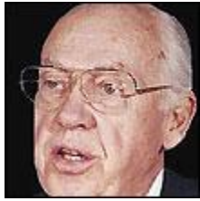
William Casey

A: My government has never said that Ames was a spy. Your CIA violated this rule when Vitaly Yurchenko [a high-ranking KGB agent] defected to the United States. Director [William] Casey told everyone that Yurchenko had become a U.S. spy and that was very foolish. It creates legal problems back home for the families of the spy. The only reason why I have discussed Walker is because there appeared some distorted stories about the Walker case in the books and in the press.