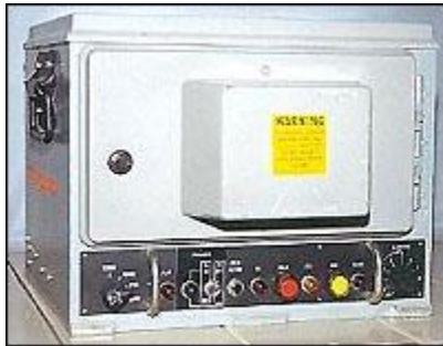
KW-7 cipher machine

A: I am surprised that he has forgotten. I didn't keep a diary, but this date I could never forget because of what followed. It was in October 1967.